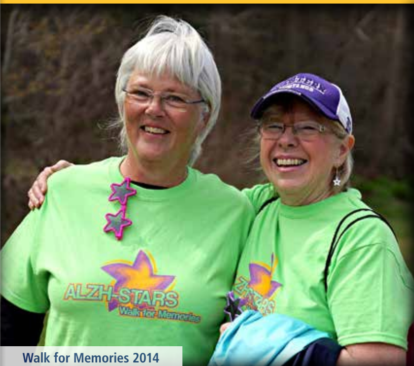
Walk for Memories 2014