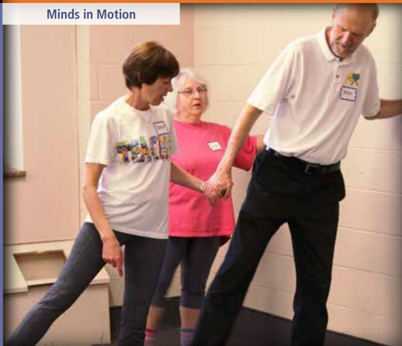
Minds in Motion

“It was my pleasure to give the donation this year. I have seen first-hand all that the Society does for patients with Alzheimer’s and their families. It is money well-spent and while I am in school I’d like to give what I can.”